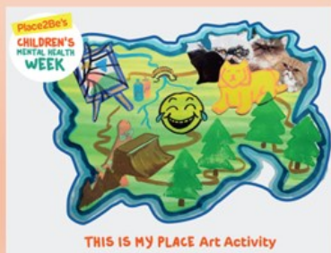
THIS IS MY PLACE Art Activity

This resource encourages children to explore their sense of belonging by creating a personal map, which can include places, groups, or activities or something not physical, where they feel they belong.